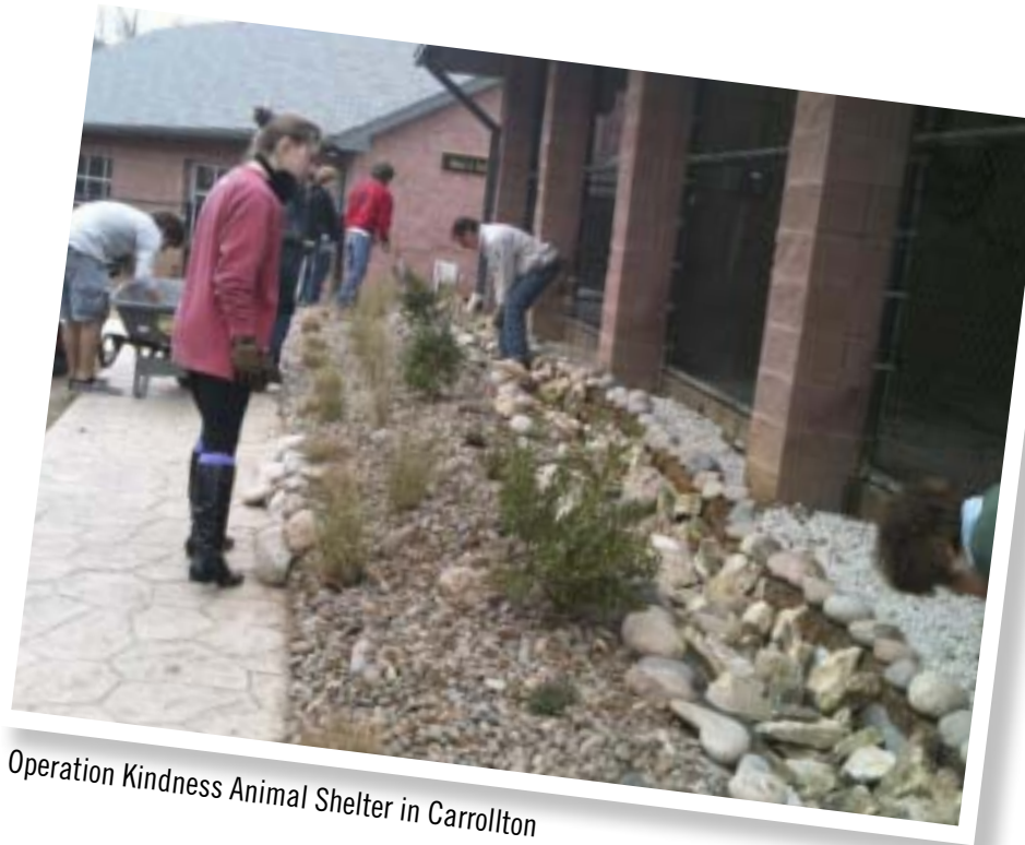
Operation Kindness Animal Shelter in Carrollton