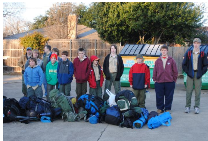
Where is our 12 th Man? And who is he?